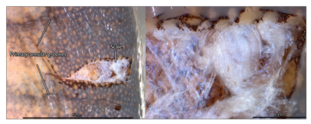
Figure 3. Scale in the connective tissue of the holotype of Caecilia museugoeldi sp. nov. Left, skin incision between the 82th and the 83th primary annular grooves. Right, a scale in the connective tissue.

In life the holotype has the head and the dorsum of the body dark grey (Figure 1). Venter and flanks are white, distinctly paler than the dorsum along the entire body (Figure 1). Dark grey color of the dorsum extends laterally and ventrally in primary grooves. Mandible and part of the head less pigmented. A greyish blotch posterior to the vent.