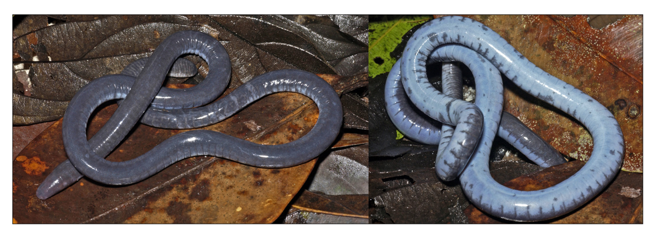
Figure 1. Holotype of Caecilia museugoeldi sp. nov. in life. Left, dorsal view of the body. Right, ventral view of the body.

Caecilia museugoeldi sp. nov. differs from C. attenuata Taylor, 1968, C. caribea Dunn, 1942, C. corpulenta Taylor, 1968, C. crassisquama Taylor, 1968, C. degenerata Dunn, 1942, C. inca Taylor, 1973, C. occidentalis Taylor, 1968, C. orientalis Taylor, 1968, C. pachynema Günther, 1859, and C. subdermalis Taylor, 1968 in having secondary