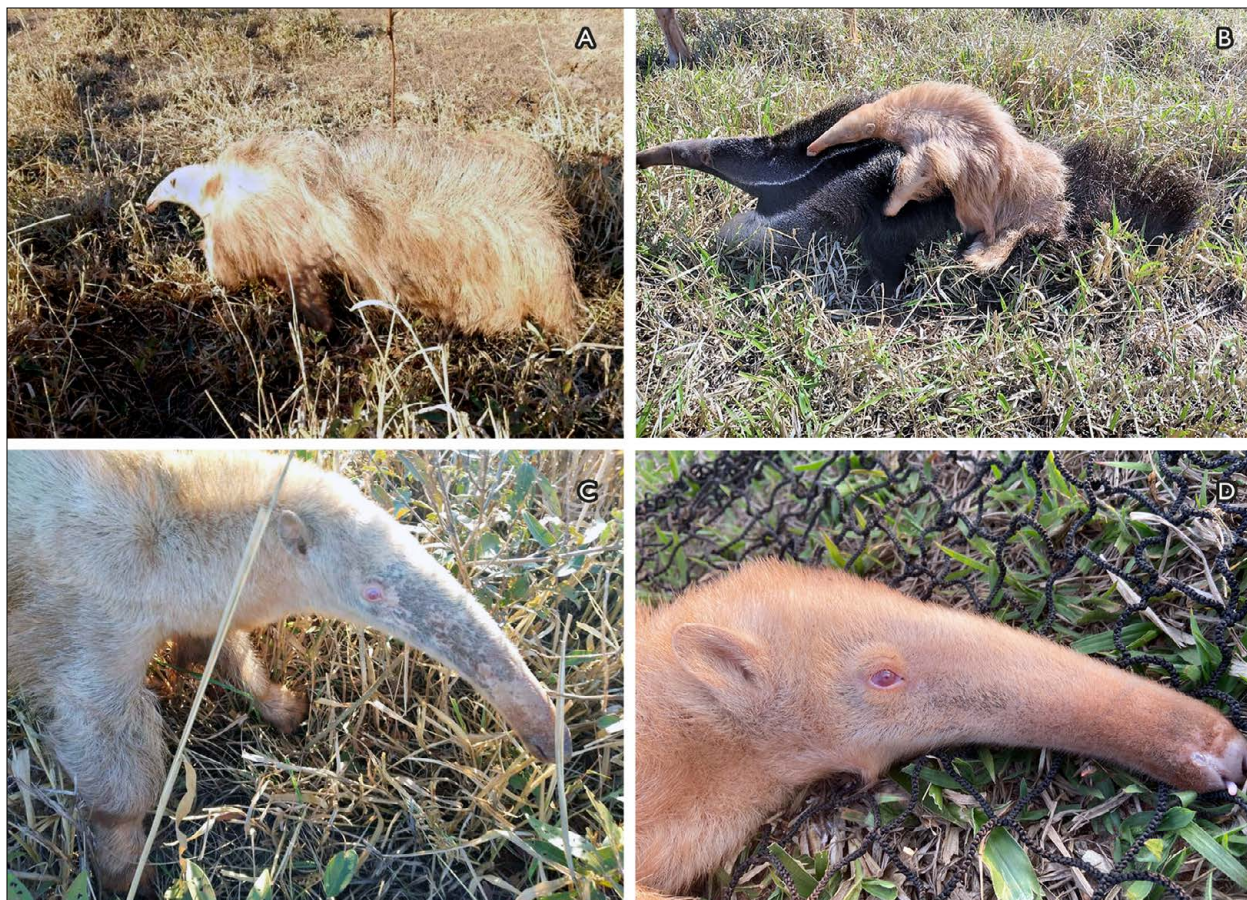
Figure 2. Giant anteater ( Myrmecophaga tridactyla ) individuals with atypical coloration pattern recorded at Barra Bonita Ranch, Três Lagoas municipality, Mato Grosso do Sul state, Brazil. (A) Subadult individual (individual #1) with atypical coloration pattern recorded in August 2021. (B) Young giant anteater (individual #2) with atypical coloration pattern (albino) on the back of its mother with typical coloration recorded in August 2022. (C) Close-up showing the faded spots with slightly darker coloration along the head of individual #1 and the characteristic red coloration of the eyes associated with albino individuals on individual #1 (C) and #2 (D).

hair samples from both albino individuals and from the female that was nursing the second one, were sent to the Molecular Biodiversity and Conservation Lab at the University of São Carlos for genetic kinship analysis. Blood samples were subjected to hematology and biochemistry analysis to assess the health conditions of the albino individual and its mother.