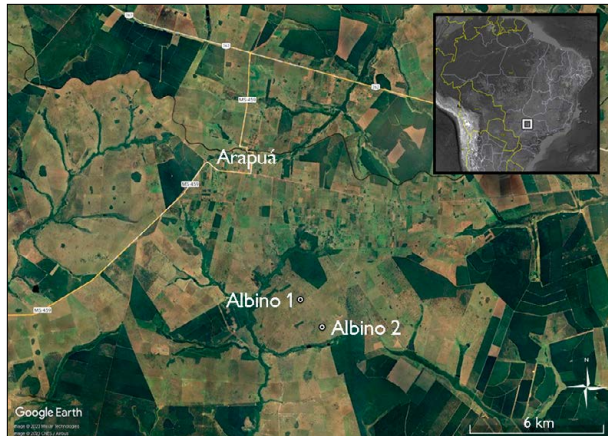
Figure 1. Study region and location of the records of the two albino individuals at Barra Bonita Ranch, Arapua district, Trés Lagoas municipality, Mato Grosso do Sul state, Brazil.

The Cerrado is one of the world's largest Biodiversity Hotspots (Myers et al., 2000), but it has one of the lowest levels of protection (1.6% strictly protected). In Mato Grosso do Sul state, only 16% (58,459 km 2 ) of native Cerrado remains pulverized in small fragments (average ~9 ha) within an agricultural matrix (Reynolds et al., 2016).