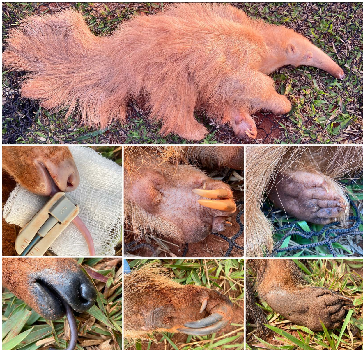
Figure 4. Morphological details of the albino individual show the lack of pigmentation on its fur (top), snout and tongue (left), forefeet and nails (middle), and hindfeet (right). The bottom photos are shown to provide a reference of the typical coloration of these body parts in giant anteaters ( Myrmecophaga tridactyla ). Images on the top were taken from the second albino individual captured at Barra Bonita Ranch, Arapua district, Trés Lagoas municipality, Mato Grosso do Sul state, Brazil, in 2022.

The albino individual and its mother, which presented typical fur and skin coloration (Figure 2B), were captured on September 5 th 2022, for the collection of