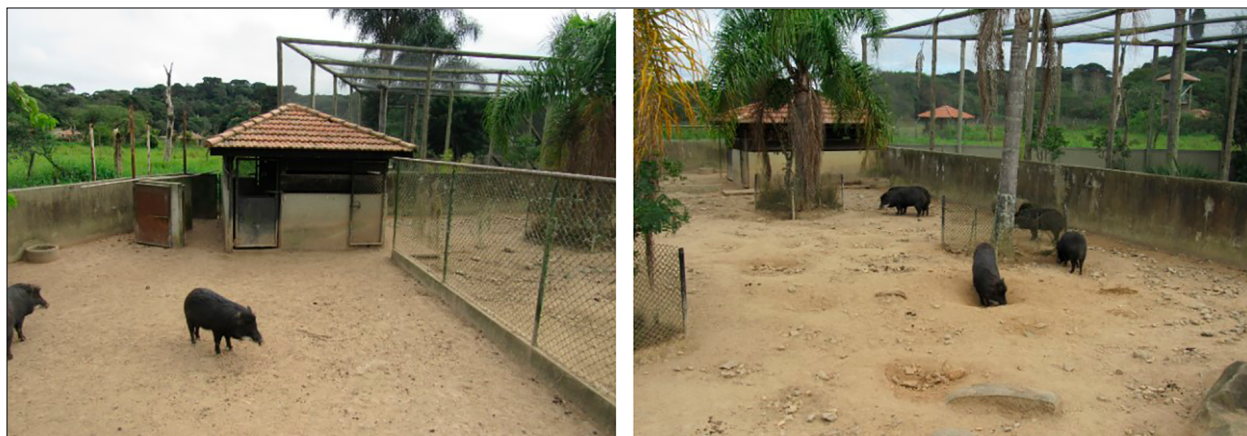
Figure 1. Enclosure of the white-lipped peccaries at the Zoológico Municipal de Curitiba, Paraná, Brazil.

Were obtained thirteen fecal samples ( n = 13 ) from seven individuals in three collections. All samples were positive for B. coli according to the spontaneous sedimentation method (Figure 2), while by the flotation method no protozoan cysts were observed. However, the feces showed normal consistency and color, and the animals did not show clinical signs related to parasitosis.